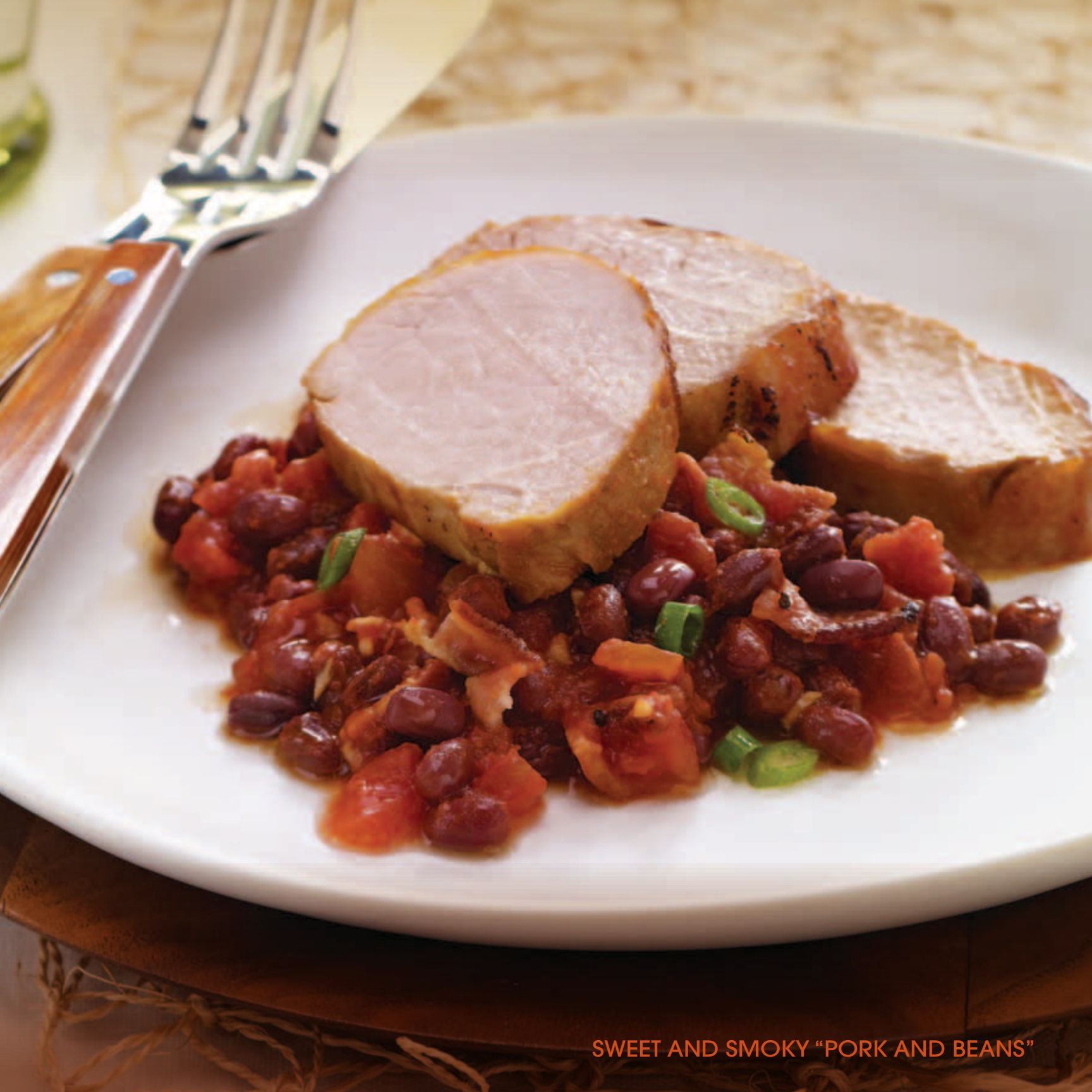
SWEET AND SMOKY “PORK AND BEANS”