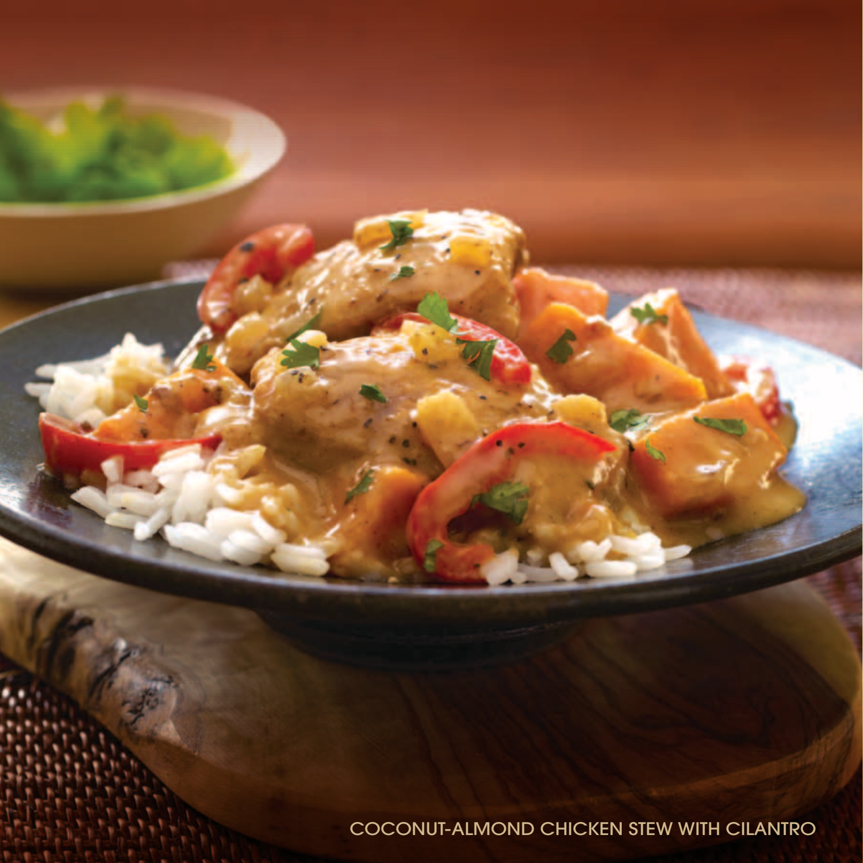
COCONUT-ALMOND CHICKEN STEW WITH CILANTRO