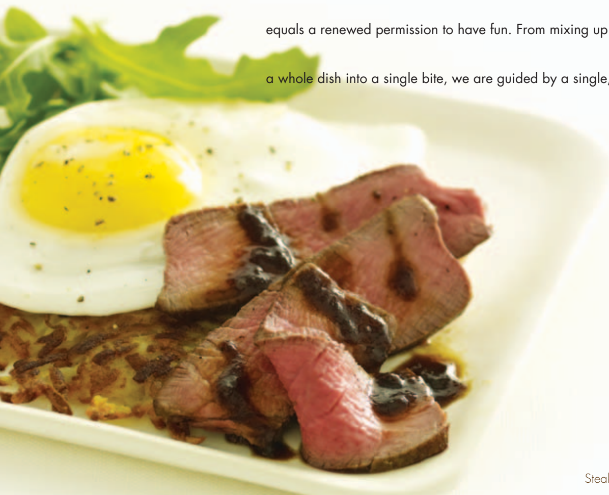
Steak and Eggs with Potato Rosti & Asian Steak Sauce

Culinary trailblazers are cooking outside the lines by discovering, reinventing and even playing with food. We now have the freedom to explore and enjoy whatever foods we want, whenever we want. Blending inspirations and shedding the confines of traditional “rules” equals a renewed permission to have fun. From mixing up dayparts to packing the flavor of a whole dish into a single bite, we are guided by a single, simple mantra: anything goes.