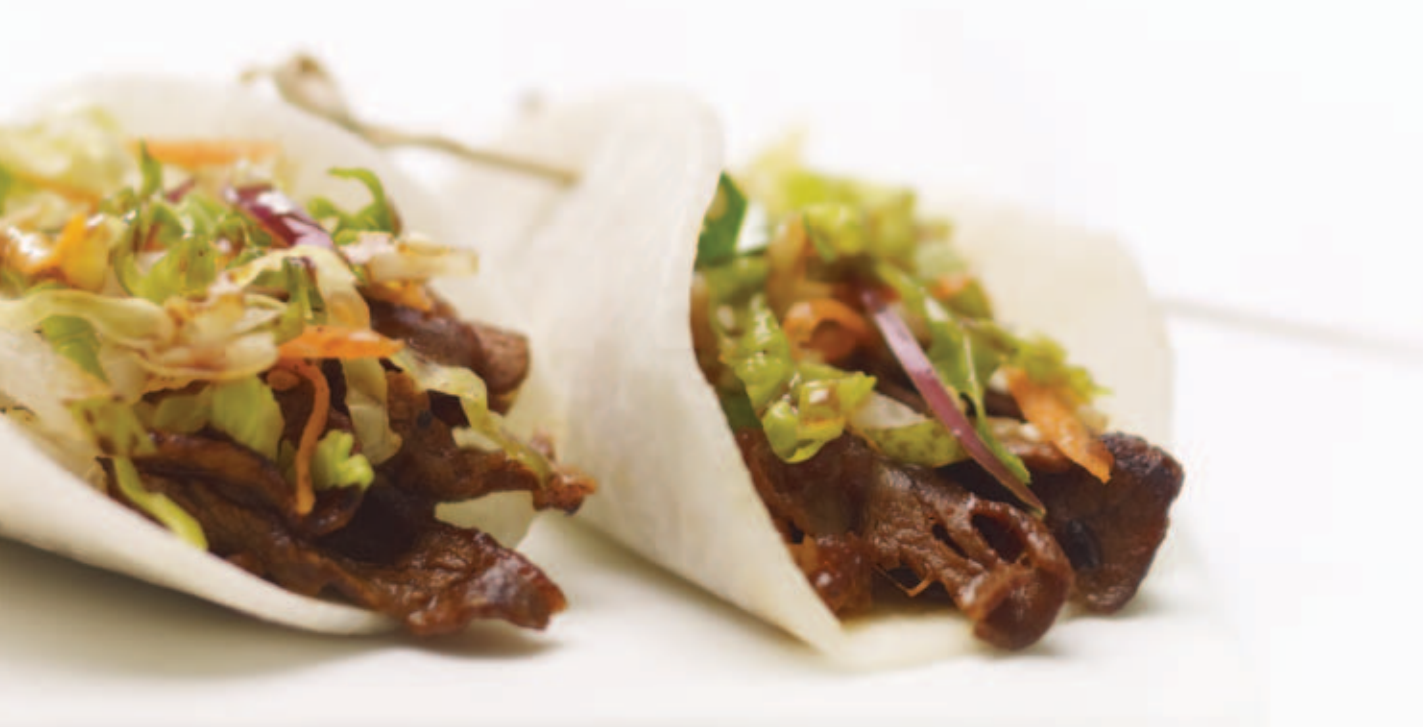
Jicama-Wrapped Short Ribs with Asian Pear Slaw

Celebrating the root of a cuisine—be it an ingredient combination, signature dish or cooking method—is a renewed global priority. As cultures evolve, preserving the integrity of regional flavors is crucial to honoring their heritage, even as lifestyles continue to change. Chefs inspired by foundational flavors and cooking styles are applying a fresh perspective that balances modern tastes and cultural authenticity.