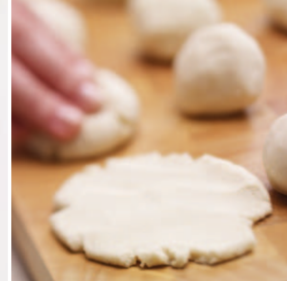
Spiced Duck Arepas with Blueberry Port Sauce

An indispensable flavoring in its native Indonesia, sweet soy is a savory-sweet, molasses-like sauce—also known as kecap manis . Together with black pepper and tamarind, these boundary-bending ingredients bring new inspiration to a condiment culture.