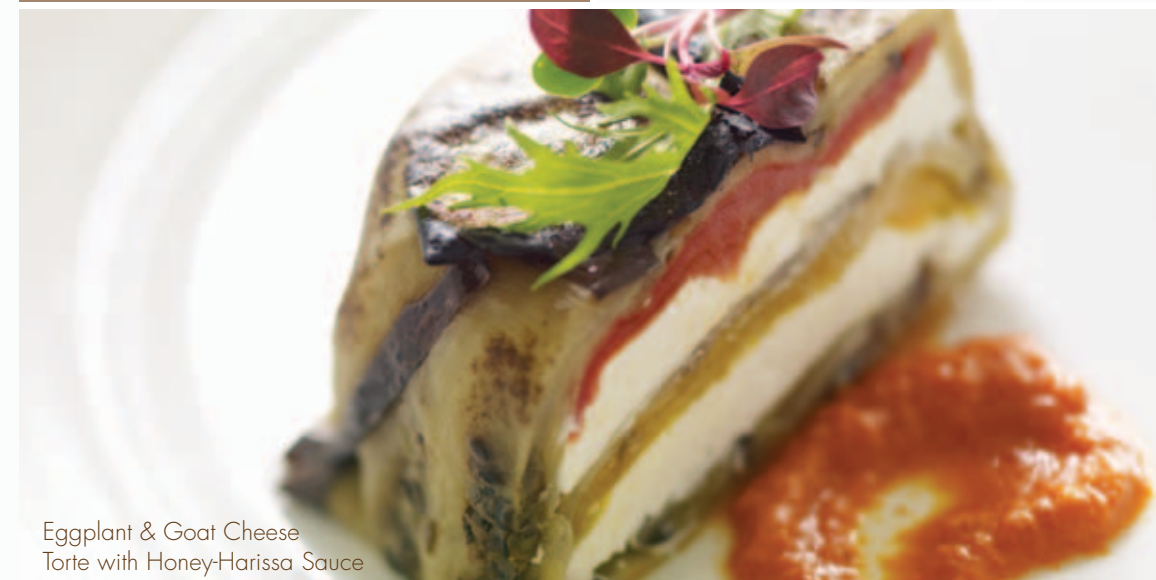
Eggplant & Goat Cheese Torte with Honey-Harissa Sauce