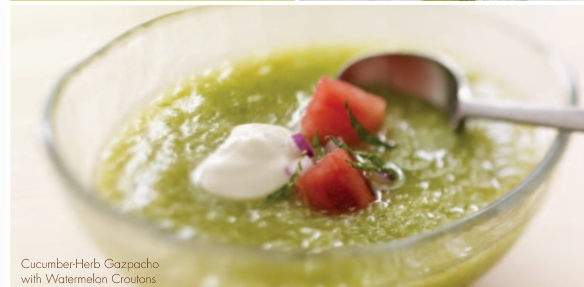
Cucumber-Herb Gazpacho with Watermelon Croutons