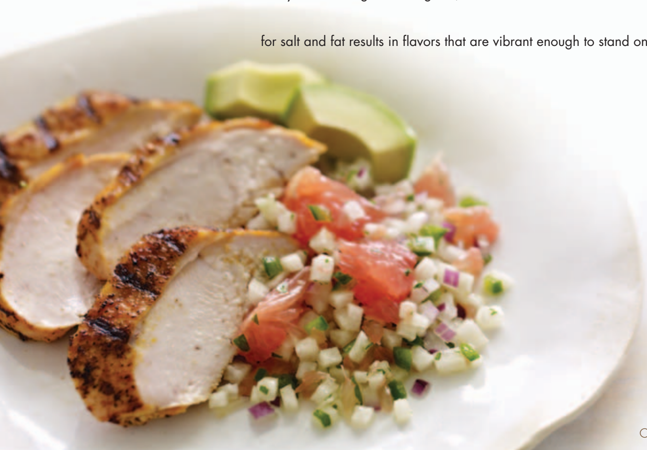
Cuban Grilled Chicken with Salsa Fresca

In the quest for personal well-being, small changes add up to big results. Simple, healthy swaps can help us make consistently better choices for the mind, body and soul—without sacrificing enjoyment. Balancing an appetite for bold flavor with a hunger for good health is key to achieving wellness goals, one delicious taste at a time. Swapping spices and herbs for salt and fat results in flavors that are vibrant enough to stand on their own.