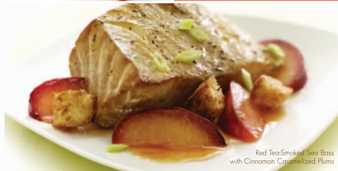
Red Tea-Smoked Sea Bass with Cinnamon Caramelized Plums

A NEW TAKE ON LEMON PEPPER. Grapefruit and red pepper deliver big flavor with purely wholesome ingredients. With a range of bright offerings—juice, zest, pulp—grapefruit meets a similarly versatile match in the exciting assortment of red pepper forms and varieties. An added bonus, this bold, sour-spicy duo also boasts promising metabolism-boosting benefits.