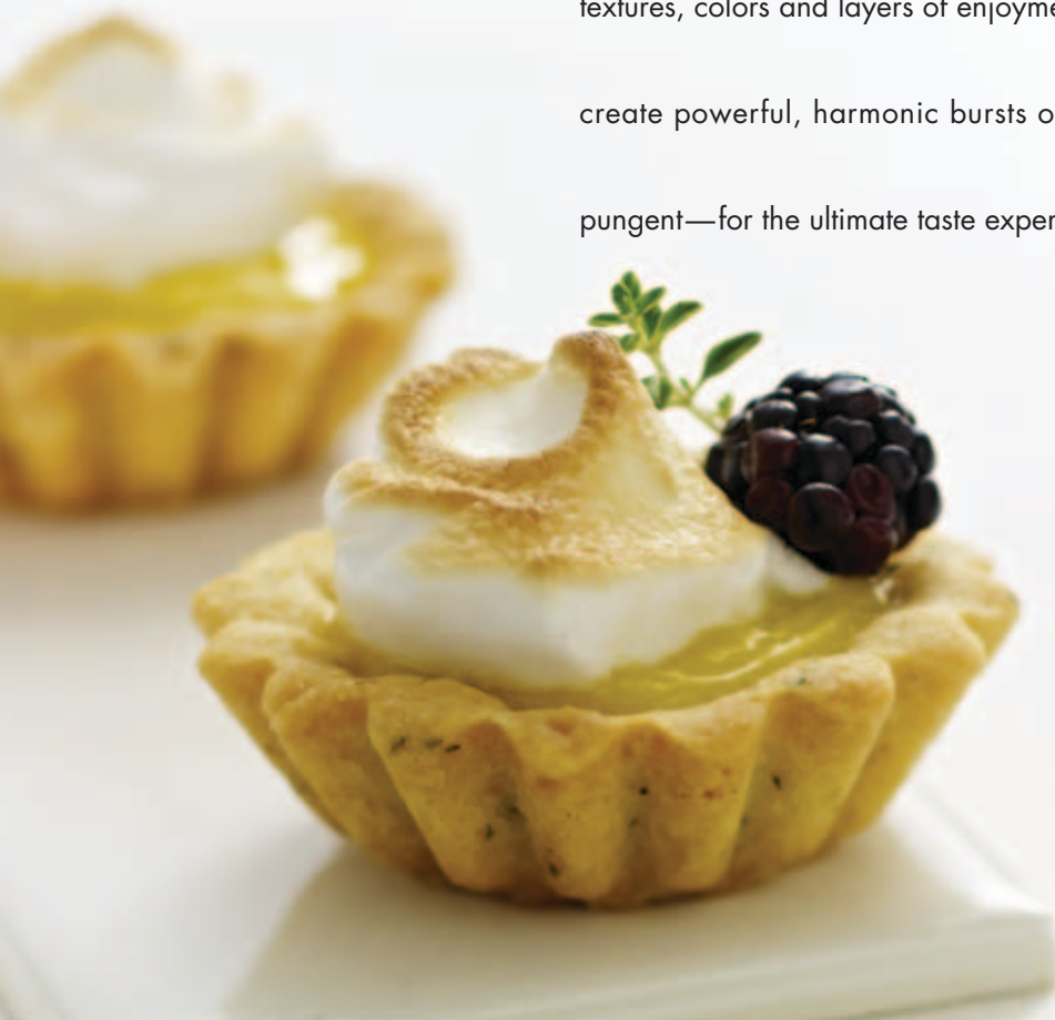
Ultimate Lemon Tarts with Limoncello Blackberries

For flavor fanatics, what satisfied yesterday will not do for tomorrow. Those searching for the pinnacle of fulfillment in food are on an endless quest to achieve ever-greater sensory heights. For some, the “ultimate” might equal superlative quality; for others, it is about a patchwork of textures, colors and layers of enjoyment. Culinary explorers are seeking out combinations that create powerful, harmonic bursts of elemental flavors—be it zesty, refreshing, umami or pungent—for the ultimate taste experience.