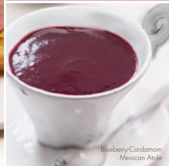
Blueberry-Cardamom Mexican Atole

In an unexpectedly delicious collision of influences, an all-American stand-by fruit meets a staple of Mexican cooking and India’s versatile “queen of spices.” The combination bursts with excitement, transcending meal times and regional borders.