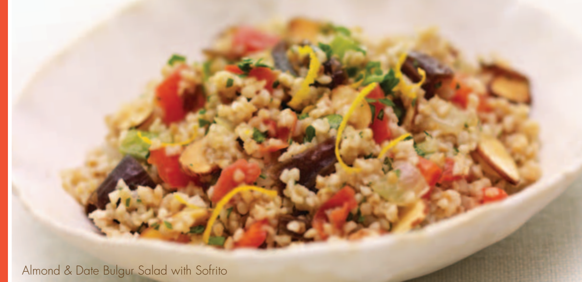
Almond & Date Bulgur Salad with Sofrito

AUTHENTIC HISPANIC FOUNDATIONAL FLAVORS. Sofrito—an aromatic blend of garlic, onion, bell pepper and tomato sautéed in oil—is the flavorful base of countless traditional Latin dishes, from Spanish to Cuban. Robust cumin, one of the world’s most widely used spices, is taking these “background” aromatics to new places on the global culinary map.