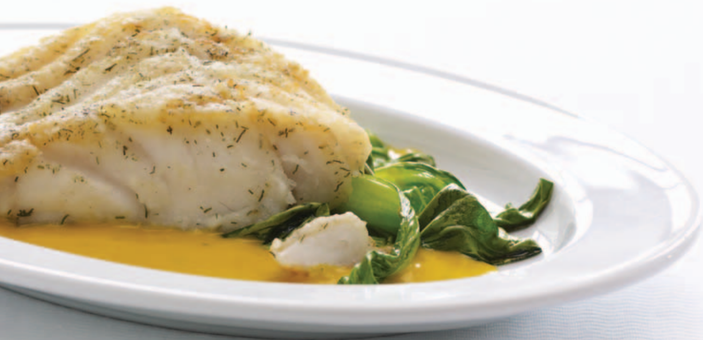
Braised Cod with Gingered Carrot-Coconut Sauce

The most memorable food is often the simplest. As cooks focus on highlighting quality ingredients with simple preparations, they have moved away from the clutter of complex presentations and flashy innovations. Their creativity is mindfully balanced with a dose of restraint. Clear, unpretentious flavors are an approachable celebration of the basics—and remind us what real food tastes like.