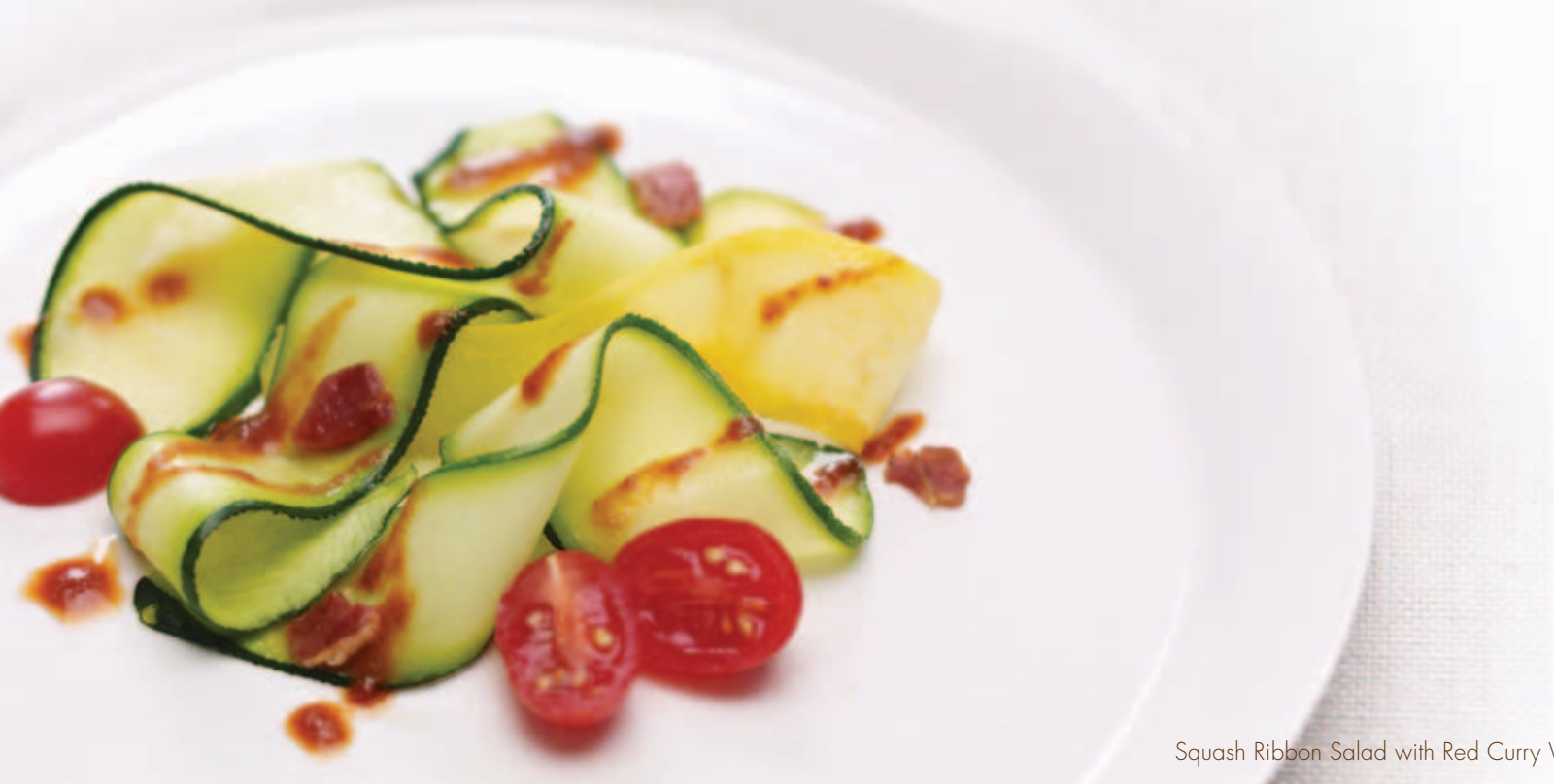
Squash Ribbon Salad with Red Curry Vinaigrette

Veggies have long been saddled with second-class citizen status, suffering from overcooking, oversaucing and lack of inspiration. Those days are finally over, thanks to the enthusiasm of chefs, the quality of seasonal produce and the unstoppable growth of fresh markets. Showcased through new cooking techniques and inventive bursts of flavor, it's finally the vegetable's time to shine.