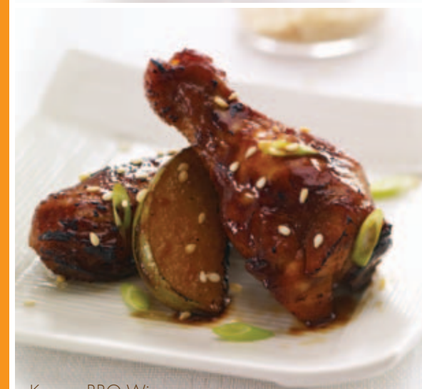
Korean BBQ Wings