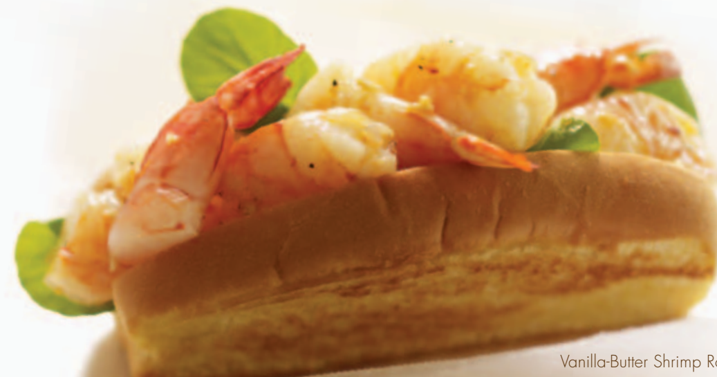
Vanilla-Butter Shrimp Rolls

Ginger's multi-faceted personality is being celebrated for its endless possibilities for sweet and savory dishes. Lush, creamy and cool, coconut is a deliciously contrasting—though wonderfully complementary—counterpoint to the intensity of ginger.