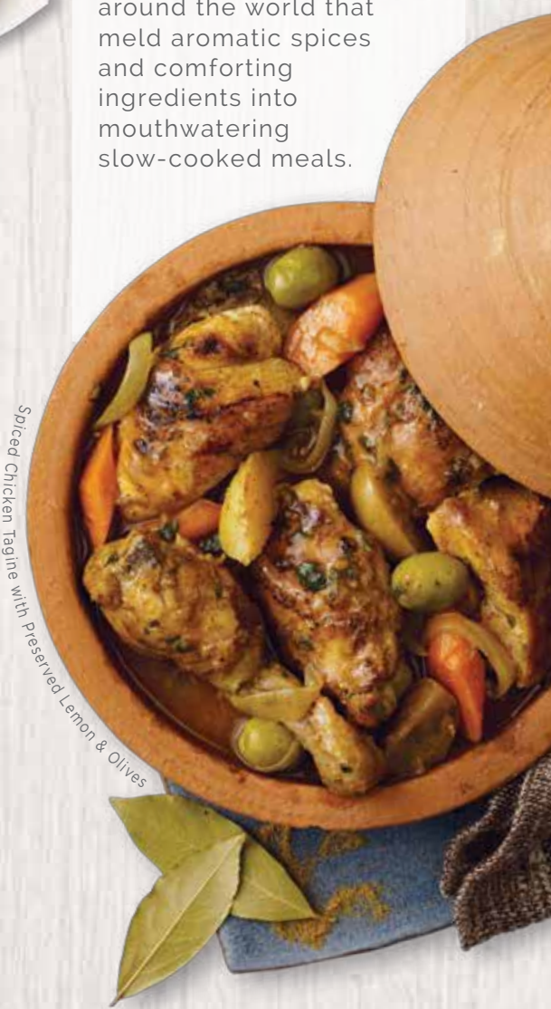
Spiced Chicken Tagine with Preserved Lemon & Olives

Lift the lid to discover the rich flavors from recipes around the world that meld aromatic spices and comforting ingredients into mouthwatering slow-cooked meals.