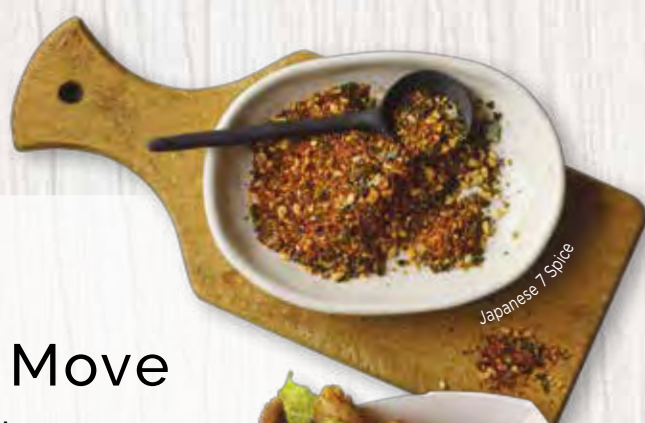
Japanese 7 Spice

Japanese 7 Spice (Shichimi Togarashi) —A pungent combination of chilies, sesame, orange zest, nori and more. Shawarma Spice Blend —A Middle Eastern street food favorite made with cumin, cinnamon, black pepper and more.