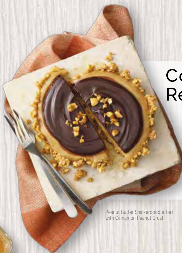
Peanut Butter Snickerdoodle Tart with Cinnamon Peanut Crust

Classic spiced cookie flavors take new form in decadent, imaginative desserts that redefine "milk and cookies."