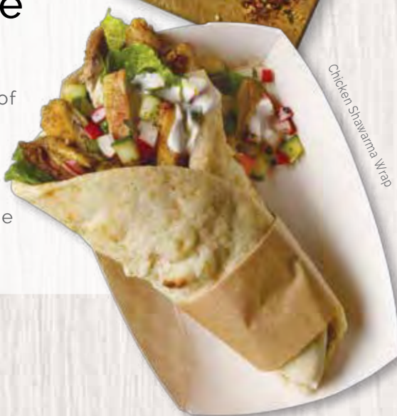
Chicken Shawarma Wrap