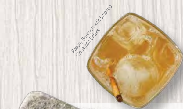
Peachy Bourbon with Smoked Cinnamon Bitters

These distinctive dips and spreads, packed with zesty herbs and seasonings, offer an approachable and delicious introduction to a vibrant global cuisine.