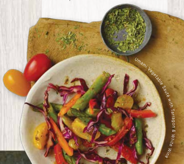
Umami Vegetable Sauté with Tarragon & White Wine

For a fresh way to savor the tempting "fifth taste," look no further than naturally umami-rich veggies like mushrooms, tomatoes, sweet potatoes and nori.