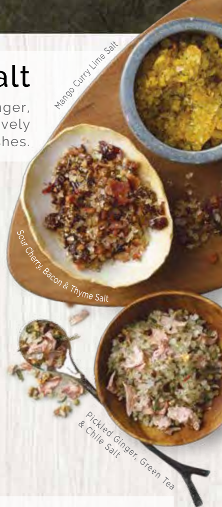
Mango Curry Lime Salt