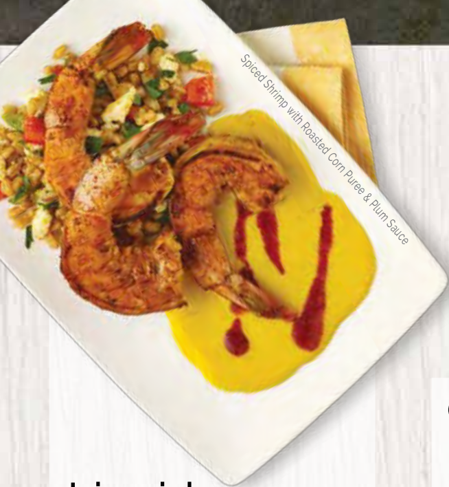
Spiced Shrimp with Roasted Corn Puree & Plum Sauce